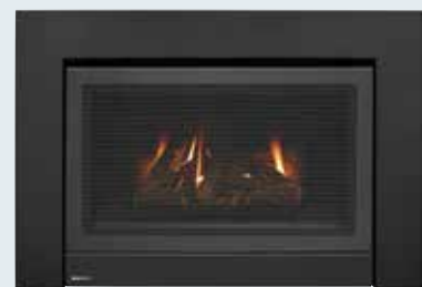
IG-34 shown with slim line fascia & dress guard.